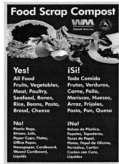
Sample of Food Scrap poster used during AT&T event.

District staff worked in cooperation with Pebble Beach Company, WMI and staff from Ecology Action to increase food scrap diversion efforts during the tournament this year. The District created bi-lingual posters for use in kitchen areas and on collection barrels. Ecology Action conducted outreach to kitchen staff and managers, and WMI delivered the material to the District food scrap compost site. Tonnage collected this year doubled over the year prior and totaled 5,540 lbs. Plans are underway to also provide this service for the upcoming US Open tournament.