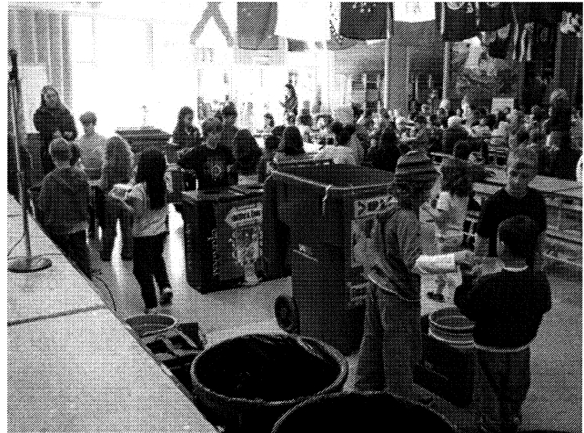
Marshall School lunchroom sorting and recycling.