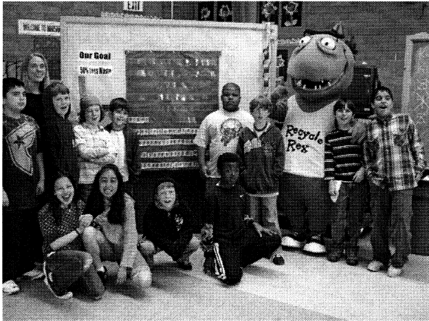
Recycling ambassador Recycle Rex with Marshall students.

In the first two months lunch room waste has been reduced by 50%, already reducing the disposal costs for the school. The students were rewarded with a visit by Recycle Rex (the blue recycling dinosaur) and Department of Conservation staff on February 29 th . On that day, Recycle Rex met and congratulated 530 children for their good recycling and visited another 350 students at Monterey's Bay View school to help kick off their waste free lunch program.